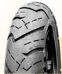
▶ MT PRO 02