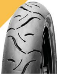
▶ MT PRO 04