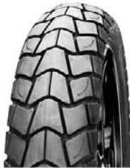
▶ MT PRO 03