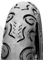
▶ MT PRO 01